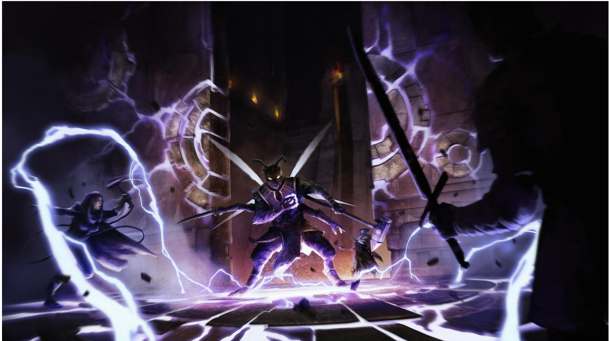
Inside the Tower

Altenor Secrets is set in the Atoriums universe: Atoriums is a timeless medieval fantasy world with a large element of mystery where movement plays an integral role. As long as you move, you are alive!